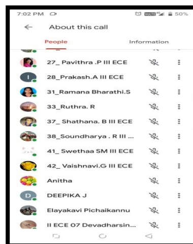
Participants attending the webinar