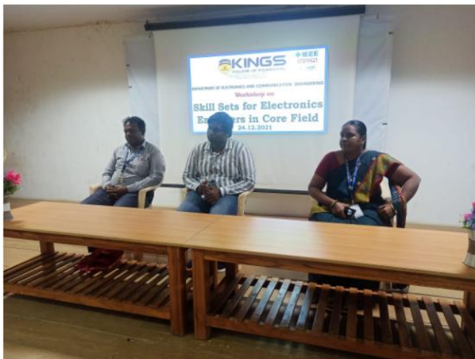
Dignitaries on the Dias during the Inauguration

The workshop was started at 1.30 pm with a prayer Song.