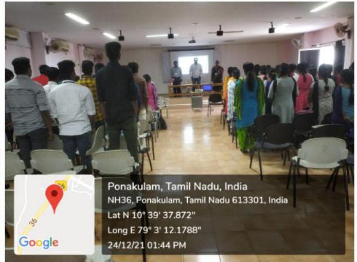
Dignitaries and Students during the Prayer Song