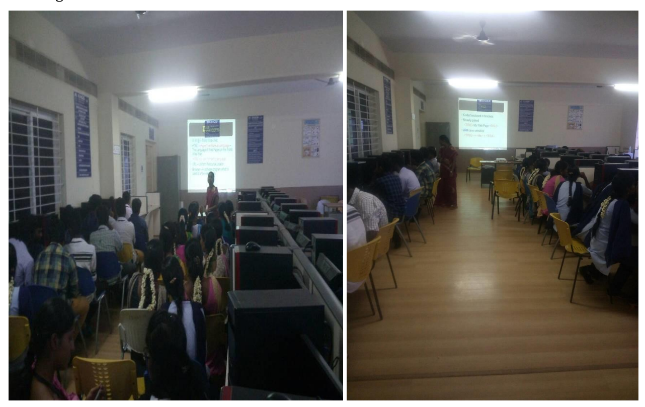
Ms.R.Ranitha AP/ CSE explained various tags used in HTML language and the students were executed the tags

Web services and its relevant programs are essential in this moment. HTML is the basic Markup language which is used to develop web service program. To meet up the current requirements the third year students had an experience in "An Introduction to HTML Language" which was handled by Ms.R.Ranitha AP / CSE. Totally 42 students of third CSE have undergone the training.