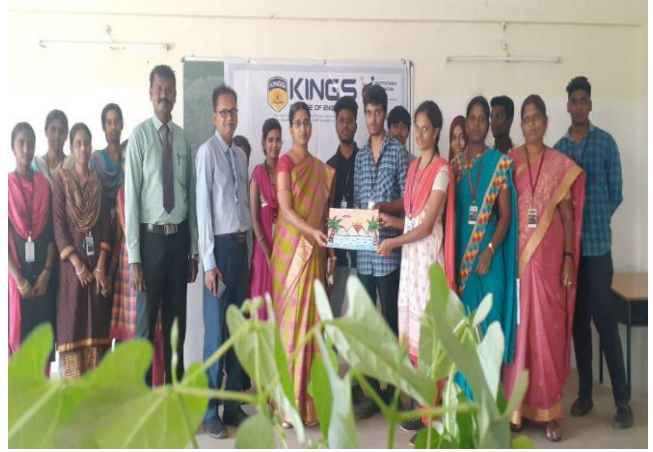
Model Expo on “Useful Products from Waste Materials”