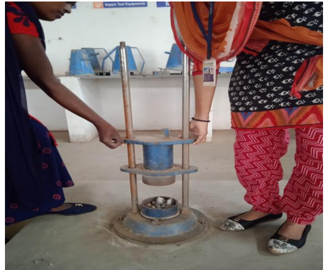
Crushing value test