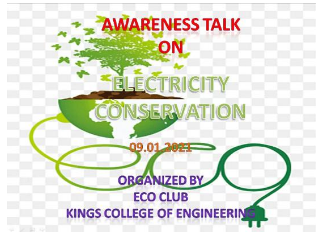
Awareness talk on "Electricity Conservation"