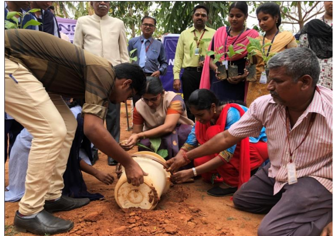
Living up to the motto of "One student - One Tree"