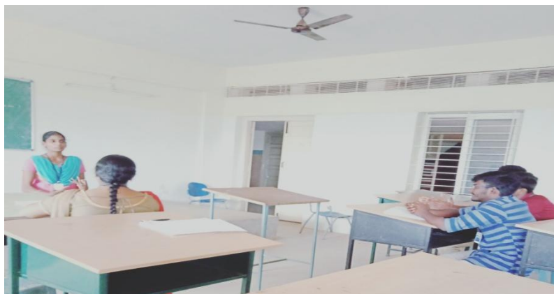
Speech Contest on "Approaches to Reduce Pollution"