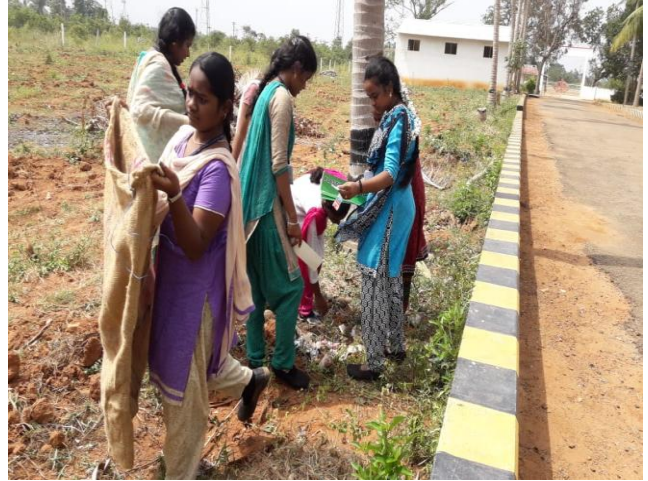
Plastic Ban Awareness Programme