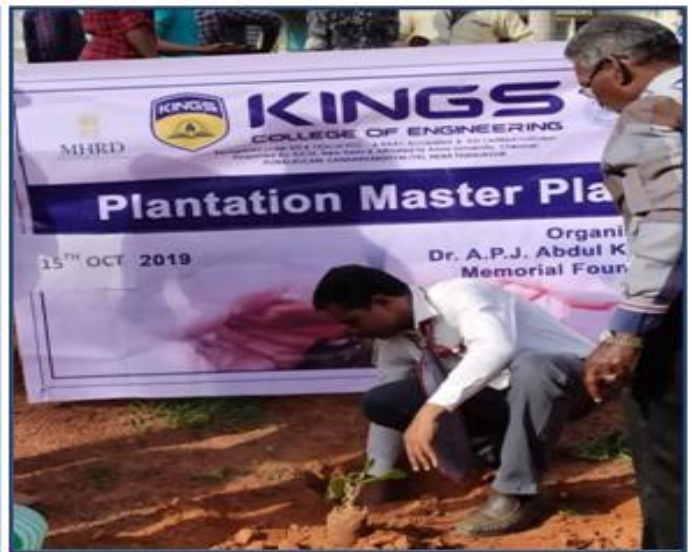
Plantation day was observed on Dr. APJ Abdul Kalam's Birthday Anniversary