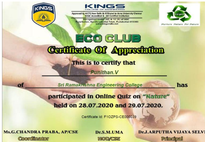
Quiz programme conducted on "World Nature Conservation Day"