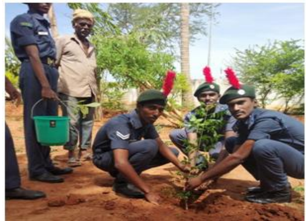
Tree Plantation by NCC Unit