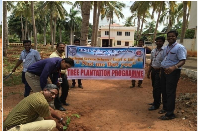
Sapling Plantation by NSS Units