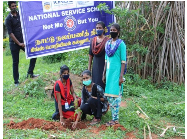
Tree Plantation was organized on NSS Day