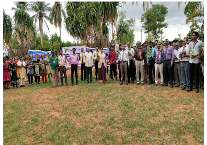
Tree Plantation by Dr. APJ Abdul Kalam Memorial Foundation