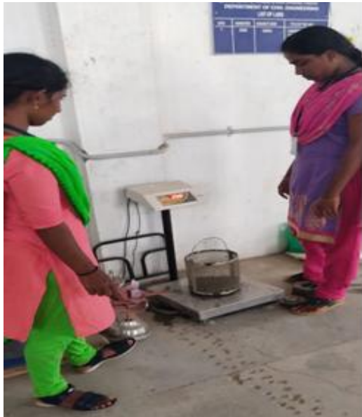
Water absorption test