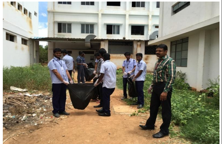
Kings Clean Campaign by NSS Units