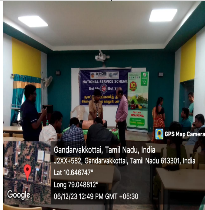
The participants are being given chances to practice.