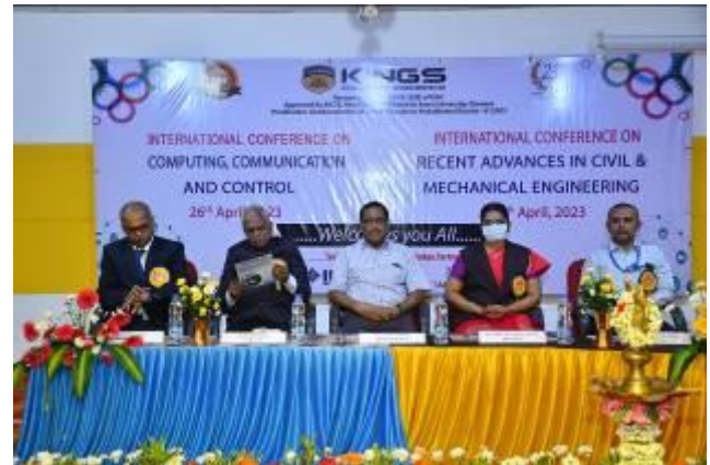
Dignitaries on the Dias