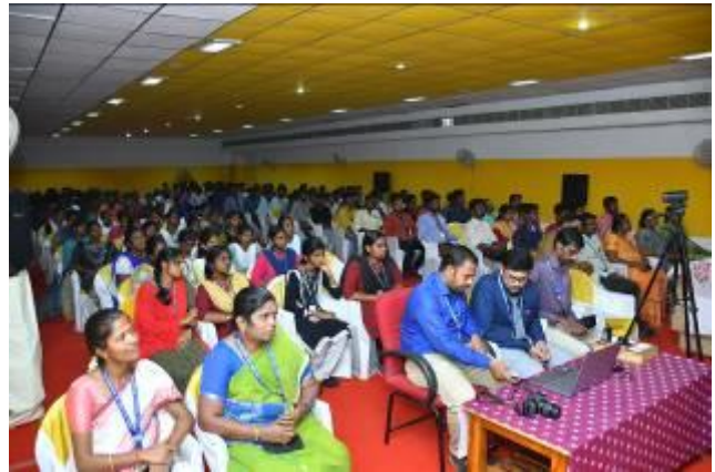
A View of the participants