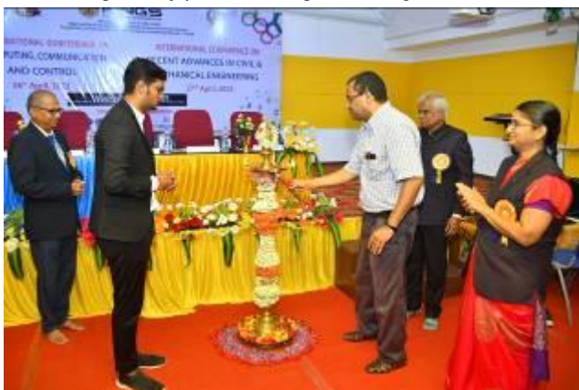
Dignitaries lighting the Lamp