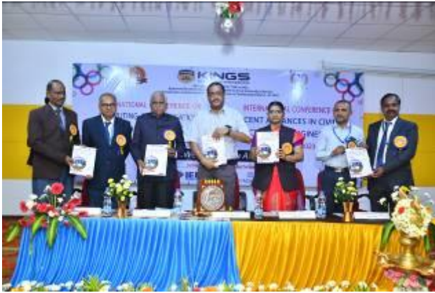
Release of Hardcopy of the proceedings