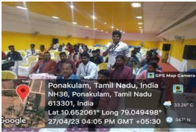
Participant sharing their feedback