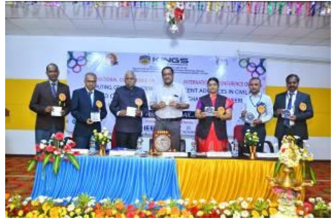
Release of Softcopy of the proceedings