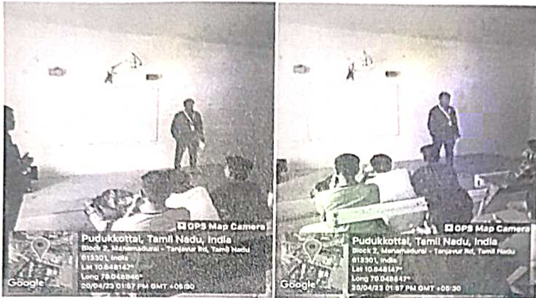
The resource person explained about Six Sigma Concepts